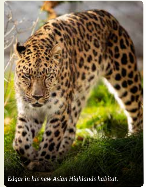
Edgar in his new Asian Highlands habitat.