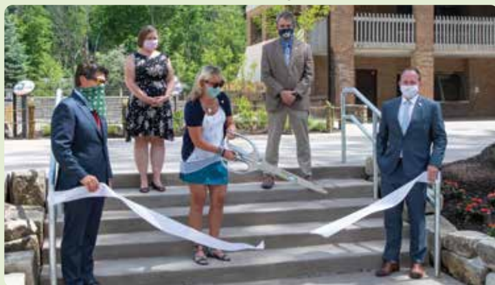
Daniel Maltz Rhino Reserve Ribbon Cutting