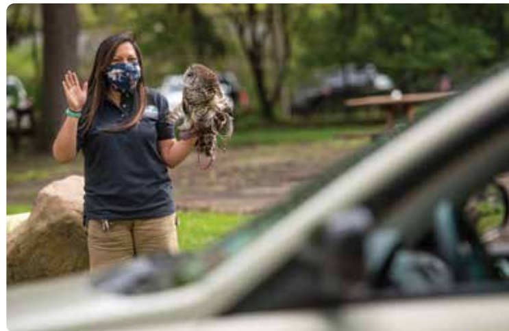
Cruise the Zoo presented by Dollar Bank

In mid-May 2020, before opening for guests, the Zoo created a drive-through experience called Cruise the Zoo, which allowed guests to drive their cars through the Zoo on a one-way path. This limited-time event was the first time in history guests were able to drive in the Zoo, and it provided much needed revenue and attendance during the three-month closure. "Cruise" dates for the popular Asian Lantern Festival were also added, and the Zoo adapted its traditional Halloween event to a COVID-19 family friendly trick-or-treat festival. The return of Wild Winter Lights proved popular, as well. All of the Zoo's special events were held with reduced capacity and safety protocols.