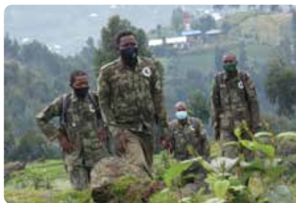
Dian Fossey Gorilla Fund trackers continued to work in alternating teams to reduce the risk of COVID-19 transmission.

Unique events emerged in the year of Covid-19, including the chance for donors to watch the new RainForest dome being lifted to the roof.