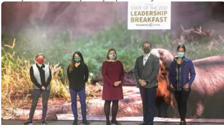
State of the Zoo Leadership Breakfast presented by Covia

To keep our donors engaged when they could not come to the Zoo, a ZooZoom series was launched in April. ZooZooms virtually brought donors "behind the scenes" to see new animals, new habitats and more during the Zoo closure and throughout 2020.